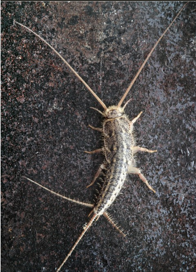
Silverfish, courtesy of Alex Wild; myrmecos.net.

Silverfish are primitive insects commonly found indoors. They are flattened, wingless insects, covered with scales that give them a silvery appearance. Silverfish also have distinctive long thread-like antennae and three, long, slender filaments (cerci) extending from the last segment of the abdomen. They are generally about 1/2 inch (13 mm) long.